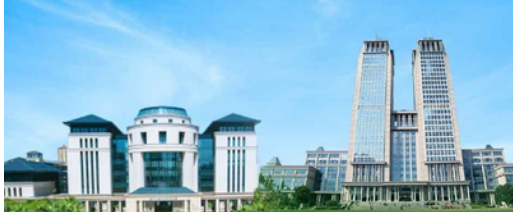
UM and Fudan University jointly offer a programme to cultivate talent in culture and tourism