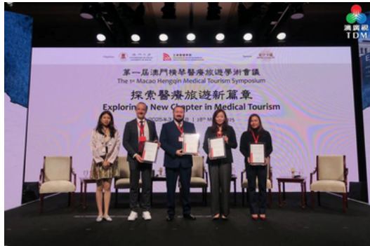
University of Macau Organized the First Macao Hengqin Medical Tourism Symposium

On 1 March 2025, the University of Macau successfully held a sharing session for the Executive Master of Business Administration (EMBA) programme in Kunming, Yunnan. The event aimed to provide prospective applicants with an in-depth understanding of the programme's features and development opportunities.