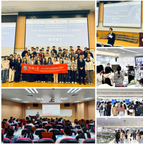
CCE and BRTC co-organized Wuhan University 2025 Youth Development Training Program (Greater Bay Area Route): A One-Day Experience at UM