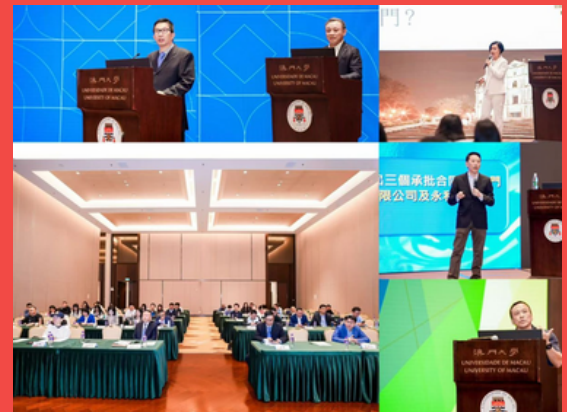
CCE and the Executive Education of FBA co-organized a training programme for students from HKU Global CEO Programme

For more details, please visit: https://fba.um.edu.mo/cce-and-the-executive-education-of-fba-co-organized-a-training-programme-for-students-from-hku-global-ceo-programme-macau-14-industrial-development-and-its-role-in-the-greater-bay-area/