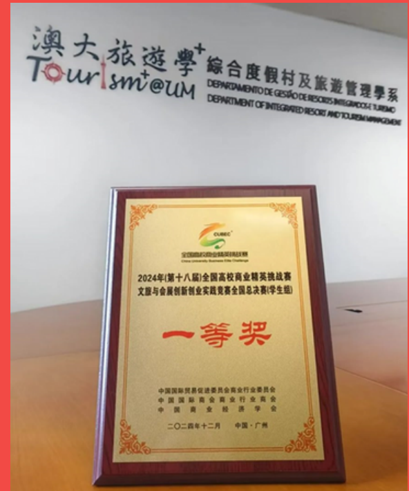
Students from the Department of Integrated Resort and Tourism Management won the National First Prize in the 18th National Business Elite Challenge for Higher Education

https://fba.um.edu.mo/congratulations-national-first-prize-students-from-the-department-of-integrated-resort-and-tourism-management-achieved-outstanding-results-in-the-18th-national-business-elite-challenge-for-higher-e/