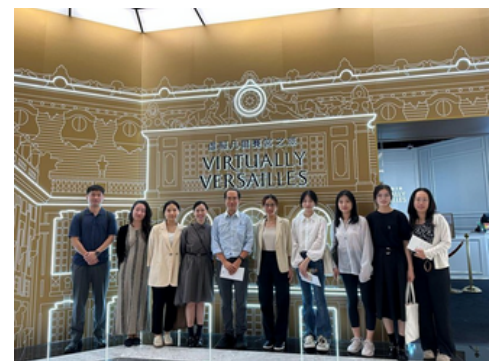
The Department of Integrated Resort and Tourism Management of the University of Macau visited the "Virtual Palace of Versailles Tour"

For more details, please visit: https://fba.um.edu.mo/faculty-and-students-from-the-department-of-integrated-resort-and-tourism-management-of-the-university-of-macau-visited-the-virtual-palace-of-versailles-tour/