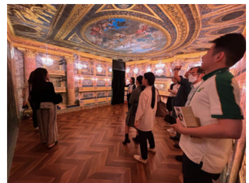
"Virtual Palace of Versailles Tour"