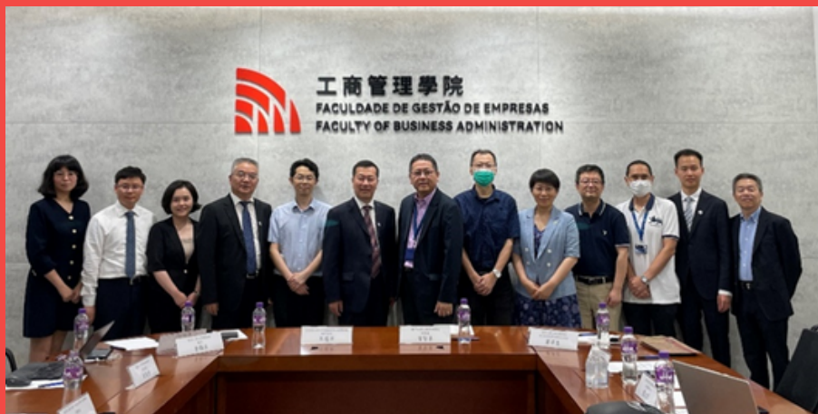
Representatives from FBA together with the Delegation of Beijing Technology and Business University (BTBU) and representatives from 北京市委人才工作領導小組駐港澳人才聯絡處