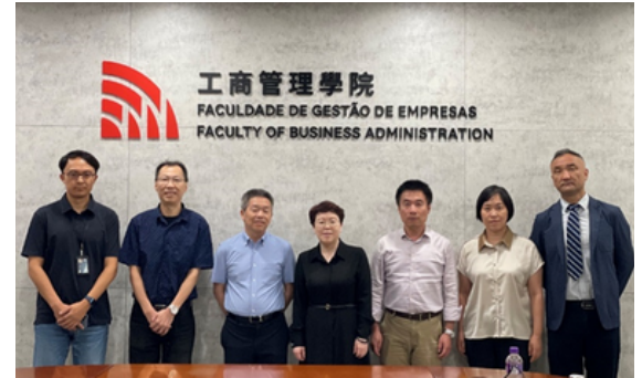
Representatives of the Department of Accounting and Information Management (AIM) together with the Delegation of the Department of Accounting, School of Business, Hohai University

On 21 June, the delegation of the Department of Accounting, School of Business of the Hohai University (Nanjing, China) visited the Faculty of Business Administration. After a Campus Tour, the delegation met with representatives of the Department of Accounting and Information Management to discuss current issues in teaching and learning and potential collaborations between the two departments and individual academics.