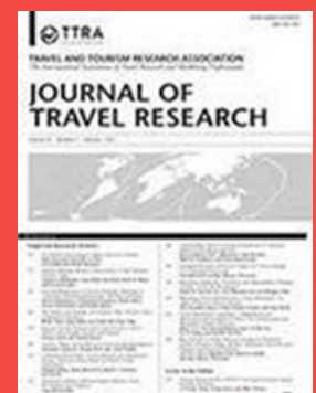
Journal of Travel Research

For details: https://doi.org/10.1177/00472875231175076