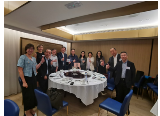
ACCA Dinner Reception