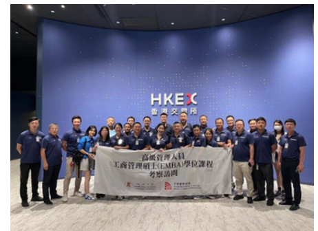
Group photo at HKEX

The 2021 intake students of the Executive Master of Business Administration (EMBA) Programme at University of Macau (UM) successfully held a study trip in the Hong Kong. During the three-day trip, which was part of the compulsory course 'Study Trip Group Report II' in the programme, students are given the chance to gain in-depth insights of latest technological trends and meet with executives and scholars through mobile classrooms, as well as the successful business models of well-known universities and companies.