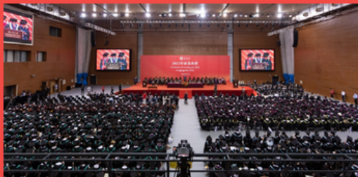
The Congregation 2023