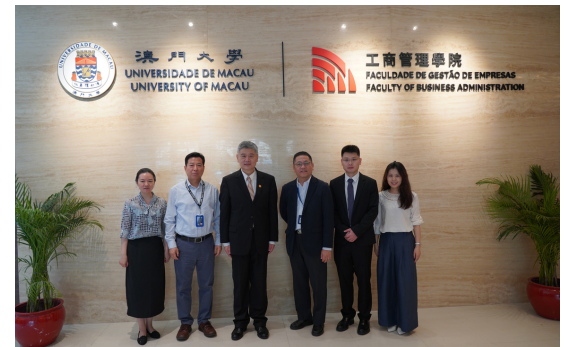
Delegation of Southern University of Science and Technology visited FBA