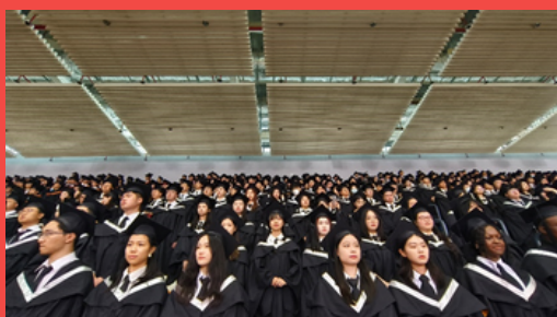
Over 473 students from FBA is conferred with bachelor degree