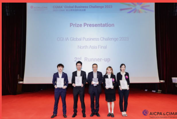
FBA Team Legend won the 2nd runner up at the 2023 CGMA GBC North Asia Final

Congratulations to the team and we thank everyone who provided support and guidance to the team.