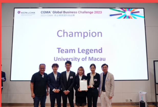
FBA Team Legend won the Champion at the 2023 CGMA GBC Macau Final