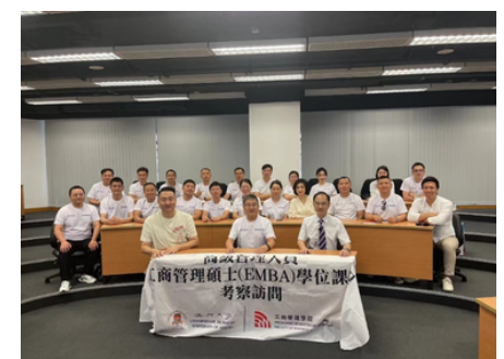
Group photo at the Chinese University of Hong Kong