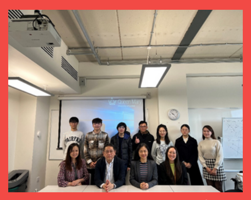
Meeting Students and Representatives of Queen Mary University of London