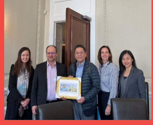
Meeting representatives of Imperial College London