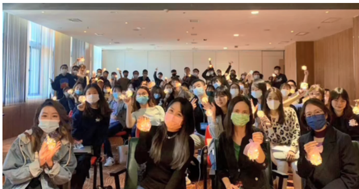
Open day highlights - Highlights of Courses and Activities in the Department of Integrated Resort and Tourism Management