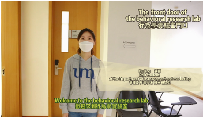
Open day highlights - Introduction video of Behavioral Laboratory