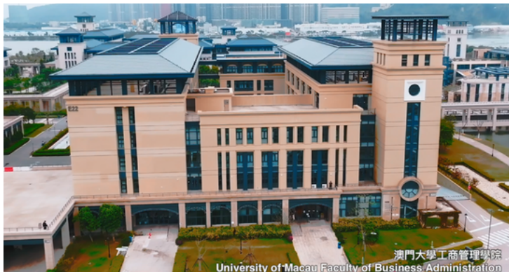
Open day highlights - FBA Facility Virtual Tour Video