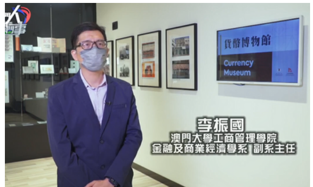
Open day highlights - TDM Programme "Our People, Our life" Introduction video of Currency Museum