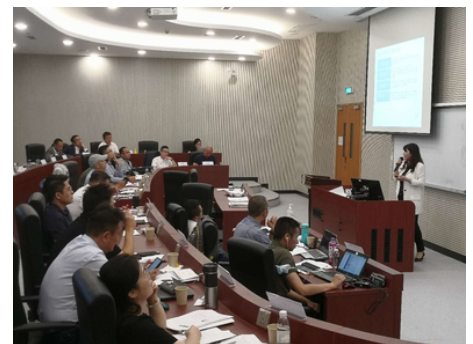
DBA class presentation