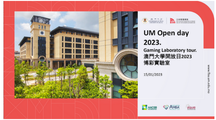
Open day highlights - Introduction of ISCG Gaming Laboratory

We would like to take this opportunity to thank you following colleagues' contributions and support to the Open Day,