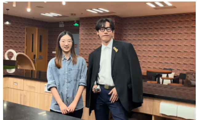
Open day highlights - Introduction video of Department of Integrated Resort and Tourism Management facilities