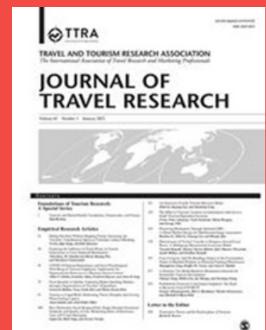
Journal of Travel Research

Risk perception has been an important construct in understanding tourists' trip planning. Surprisingly, while tourists' perceived tourist-host identity risk (THIR) plays an essential role in this process, its effects have been overlooked. Against this backdrop, this study develops a THIR scale and investigates how it shapes the intention of mainland Chinese tourists to revisit Hong Kong, and also investigates the spread of positive word-of-mouth (WoM) by conducting multiple online surveys with mainlanders. The results show that THIR is a uni-dimensional construct which is robustly measured by 12 items. It undermines revisit intention and the spread of positive WoM because of lower emotional solidarity followed by anticipation of unpleasant experience. This negative serial mediation is weaker for people who have a strong Chinese identity and perceive high THIR of an alternative destination (Macao). Meaningful implications are provided for destination marketers.