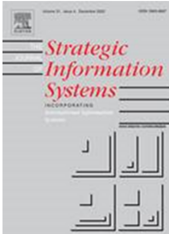
The Journal of Strategic Information Systems