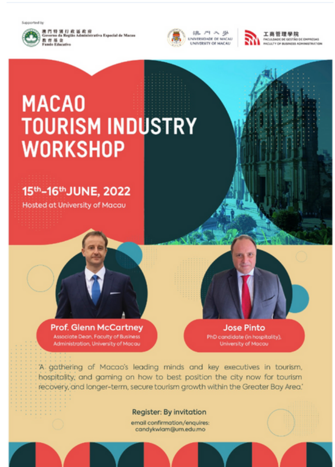
Macao Tourism Industry Workshop

https://fba.um.edu.mo/macao-tourism-industry-workshop-series-july-2022-edition/