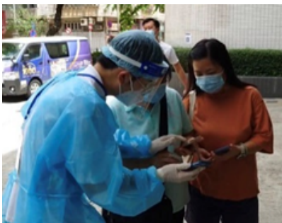
UM volunteers helped with registering residents waiting for a COVID-19 test

For more details, please visit: https://www.um.edu.mo/news-and-press-releases/press-release/detail/53800/