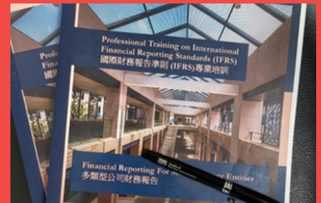
Teaching material of the IFRS training