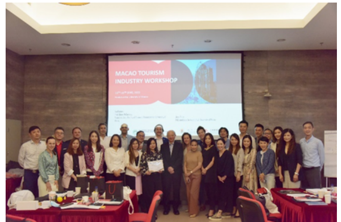
Workshop Group photo