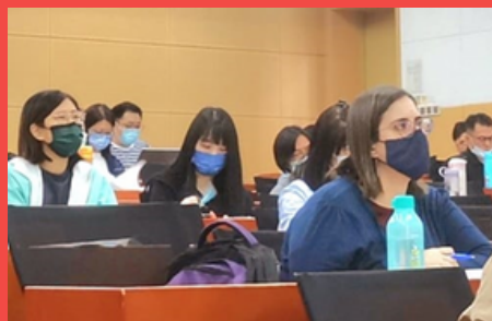
The IFRS training attracted 50 practitioners of both public and private sector