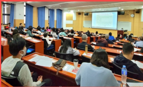
The 2nd Professional IFRS training is successfully held

With the implementation of the new Macau IFRSs in 28 March 2020, both CPC and BRTC aim to organize more similar trainings in the near future to cover various aspects of the IFRSs to ensure practitioners are provided with the updated accounting knowledge and a more thorough understanding concerning the new IFRSs adopted in Macau.